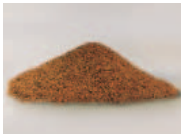
Squared timber for Friction Smokegenerator